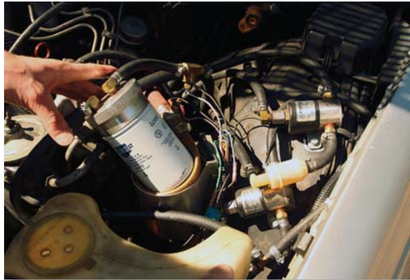
The converted vehicle runs on waste vegetable oil and diesel.

Using his converted car, Gorum fills up his diesel tank every 4,000 to 9,000 miles (depending on number and length of trips). When using diesel, he averages 30 mpg, while veggie oil nets 28 or 29 mpg. The