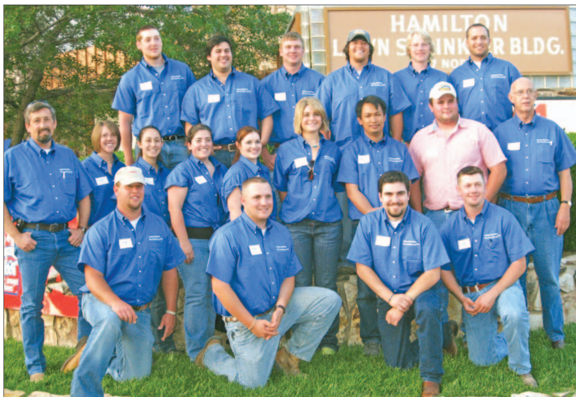
The Southern Great Plains Dairy Consortium inaugural class of 2008.

At the moment of this writing we are in the midst of planning the 2009 program which will expand on and enhance the experiences from this summer's program. The current plan is to add modules which were not covered the first time, such as reproduction, animal health and human resource management. For more information on this rapidly developing program, please visit the internet at http://sgpdct.tamu.edu/