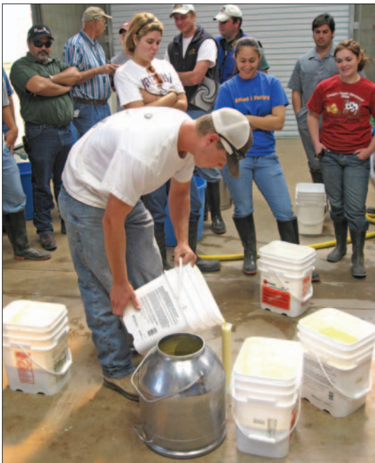
Students observe colostrum management techniques at Dutch Valley Dairy in Clovis, NM.

It is difficult to identify the cause of this trend because two factors play a major role: federal funding, and student enrollment. When student enrollment drops, federal funding is reduced and university resources become more limited. Regardless of which came first, fewer students or less federal