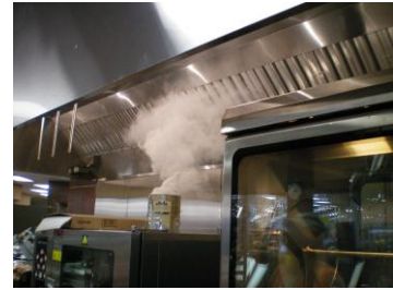
Smoking a hood.

Summer is a very busy time at LCDPHE. There are many things going on in all the departments and for a self-motivated individual, this internship can provide a wealth of experiences. As an unpaid internship there are scholarships available and it does qualify for Americorps Service.