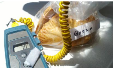
Foods found out of temperature....