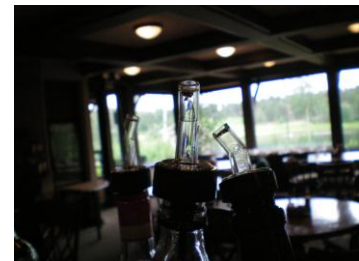
Fruit flies in liquor bottles.