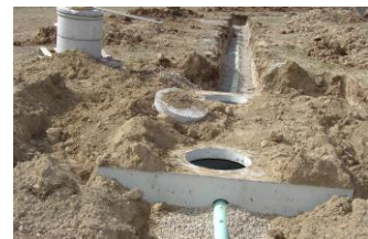
Example of a septic system