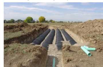
Example leach field.