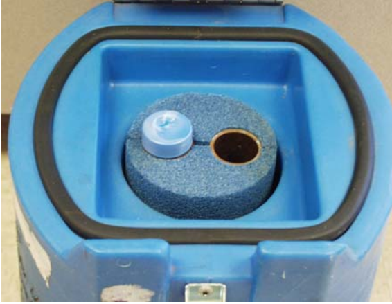
Vial with embryo in shipping container